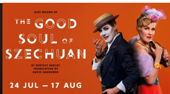
Make-up & Hair for Silo Theatre & Auckland Theatre Company